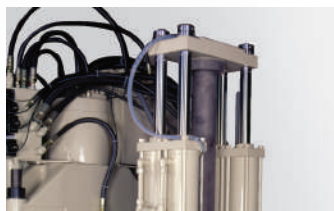
BMC進料 BMC Material Loading